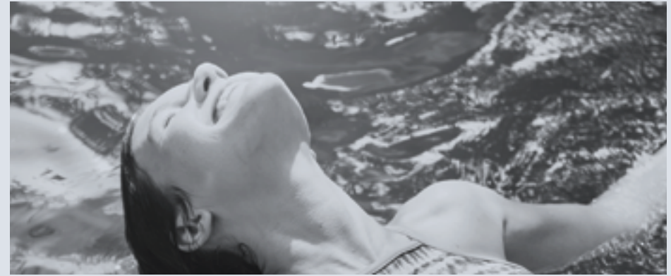
Smile, breathe, and go slowly

Maximum comfort and rest for the limbs of the body, providing them with all the hydration and nourishment they need. Improves blood circulation and relaxes the muscles.